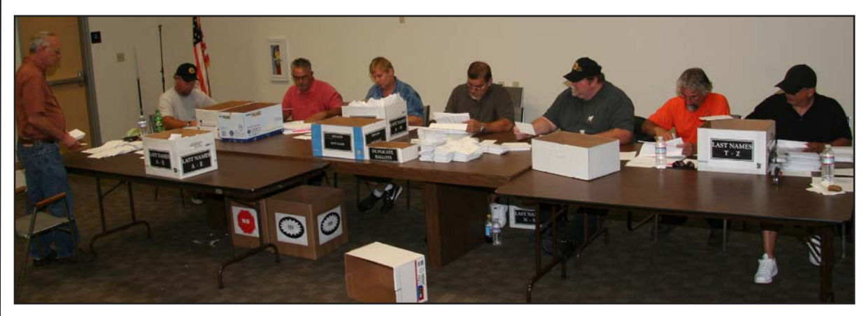
Unit 12's eight-member, rank-and-file bargaining team counts the thousands of ballots sent in regarding the contract.